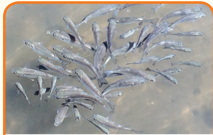
He ‘ōiwi ka ‘ama‘ama no Hawai‘i a me kekahi mau ‘āina a puni ka honua, e la‘a me Kāmoa, Iāpana, Kanakā, Perū, ‘Īkālīa, ‘Aikupika, a me ‘Īnia.