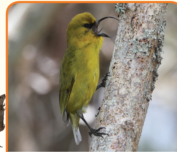
He manu ‘ōiwi ka ‘akia pōlā‘au no Hawai‘i nei. Ua lilo nō ho‘i he meaola ‘ane halapohe ma muli o ka makika, ka po‘ii‘a he ‘iole, a me kōkua kōkua.

‘O kekahi mea minamina loa ho‘i, ‘o ia ka ‘ ane halapohe o nā meaola ‘ōiwi i ka hana a nā malihini a me kōkua kōkua. He make pau loa nō paha koe o lākou. A i ia halapohe ‘ana o kekahi meaola ‘ōiwi, ‘o ia hopena like nō paha no nā meaola ‘ē a‘e e kauka‘i ana ma luna ona. He ala ho‘i ‘ole mai ko ka meaola halapohe.