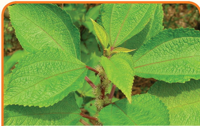
‘Āpa‘akuma ka māmaki no Hawai‘i. ‘A‘ole ‘eha ka ‘ili ke ho‘opā aku. ‘O kona kupuna na‘e, ‘oi‘oi kona heu. Kū nō ho‘i i kona inoa Pelekānia he “stinging nettle”!

I mea e ola ai ma Hawai‘i, ua pono kekahi mau meaola e ho‘oma‘a a ma‘a i ka ‘āina hou. I ke au lō‘ihi loa o ka manawa, ua loli ko lākou kino a kūpono no kēia wahi. ‘O ia mau loli ka mea i ‘oko‘a loa ai lākou mai ko lākou po‘e kūpuna i hiki mua mai i Hawai‘i. Ua lilo lākou he mau mea ‘āpa‘akuma no Hawai‘i nei.