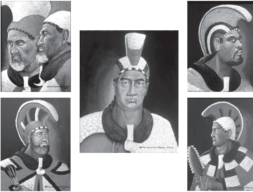
Kamehameha's 'aha 'ula (council of chiefs)